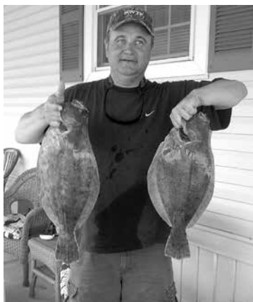
Freestate President didn't get his gobbler this morning, but this will do.