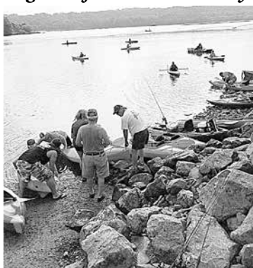
Freestate WITO kayak trip ready for launch.